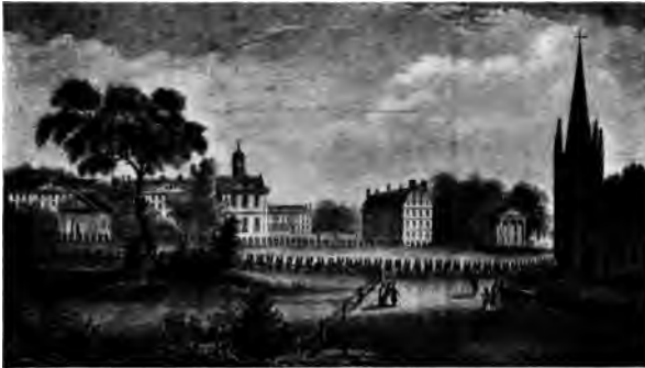
HARVARD UNIVERSITY WHEN HE ENTERED